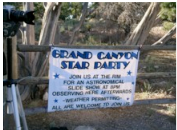
This year’s banner at the South Rim

I highly recommend popping into the North Rim sometime for this annual star party. It is a bit further to drive, but I think you’ll find it more relaxing and a lot less crazy than the South Rim. Or consider alternating north and south rims like we did for a few years.