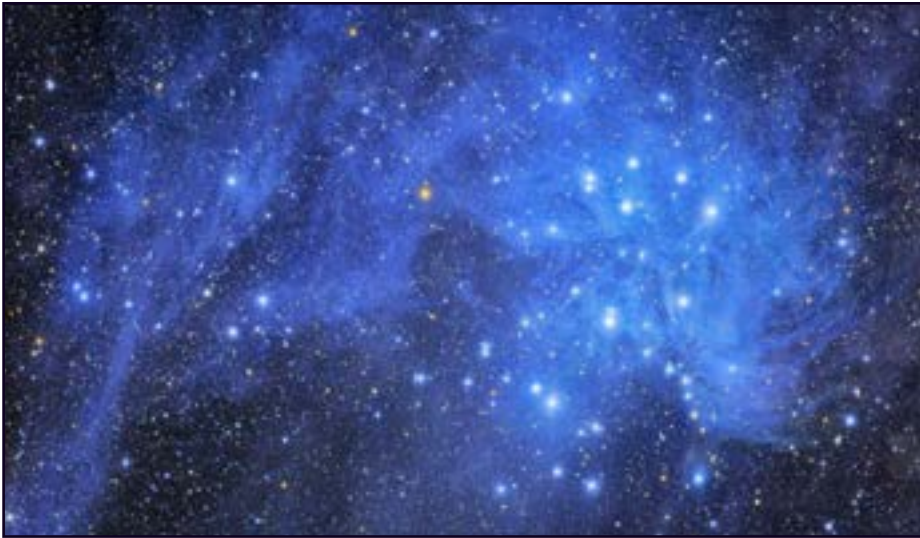
Pleiades and Stardust APOD November 22, 2007