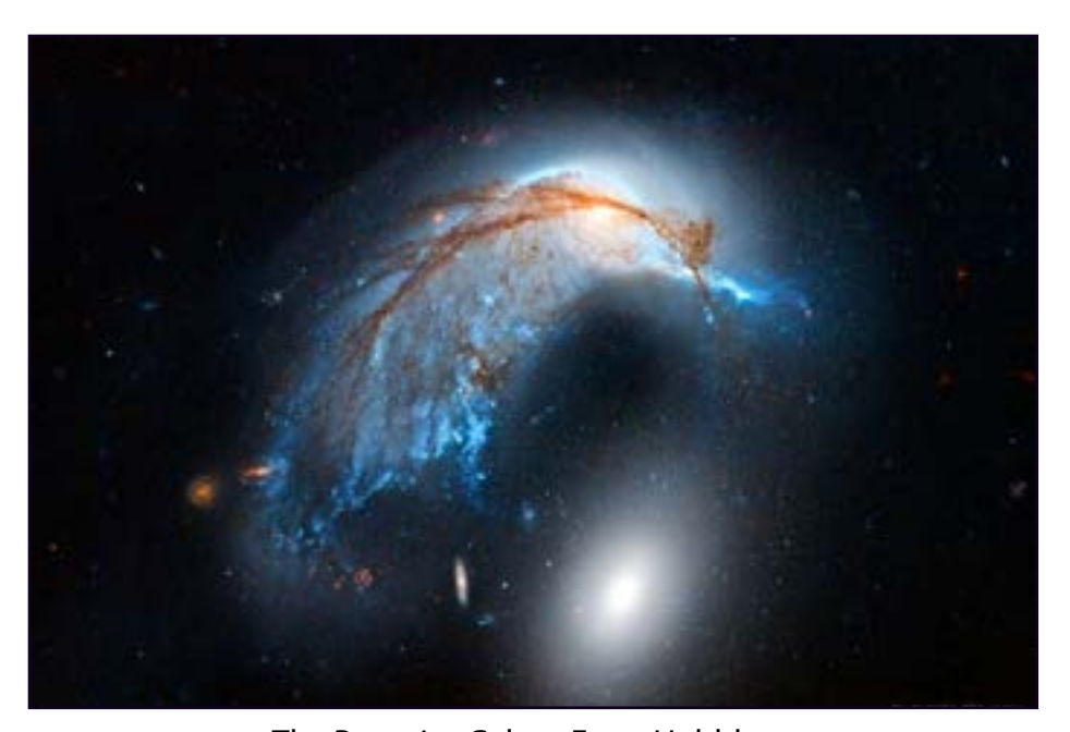
The Porpoise Galaxy From Hubble APOD February 6 2017, Image Credit: NASA, ESA, Hubble, HLA